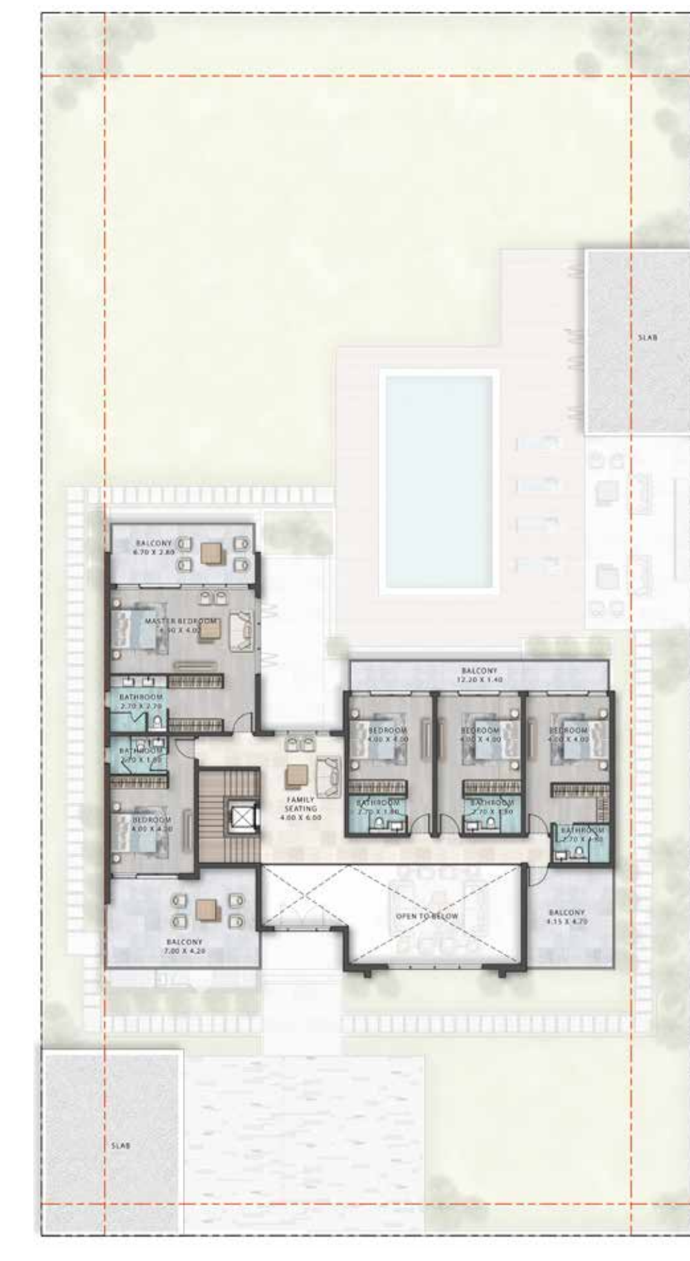
6 BEDROOM + MAID + DRIVER 6,500 SQ. FT.