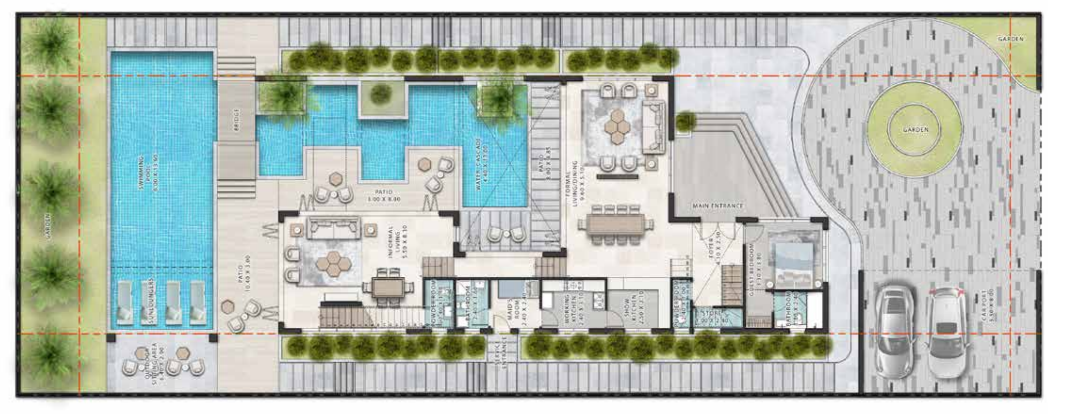
5 BEDROOM + MAID 3,500 SQ. FT.