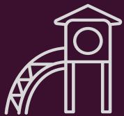
Kids Play Areas