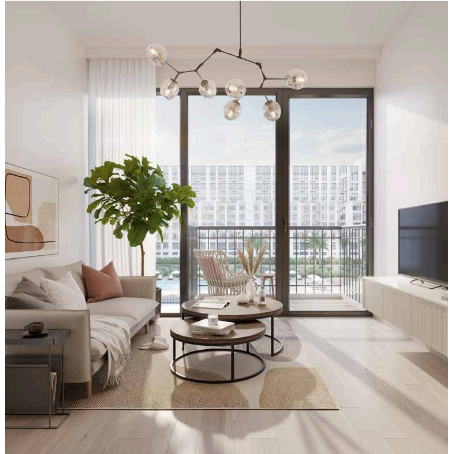
Studio Living room